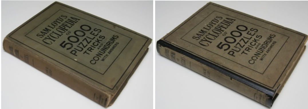
Sam Loyd's Cyclopedia of 500 Puzzles, Tricks & Conundrums With Answers by Sam Loyd

(left: "FRANKLIN BIGELOW CORPORATION, THE MORNINGSIDES PRESS PUBLISHERS"; right: "LAMB PUBLISHING COMPANY"; both NY, 1914, 11.5" by 8.5" by 1.5" , hard cover, 384 pages; volumes are identical except for the publisher listed on spine and title page; the black on the spine edges on the right is from a professional repair in 2008)