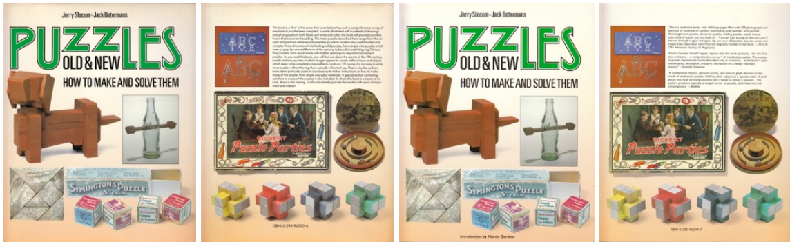
Puzzles Old & New - How to Make and Solve Them by Jerry Slocum and Jack Botermans

(Plenary Publications, Distributed by U. Washington Press, 1986 hardcover 10.75 by 9.25 inches & 1987 soft cover 10.5 by 9 inches, 128 pages)