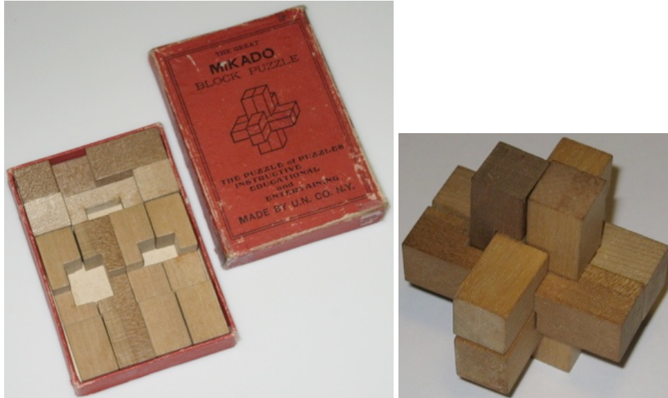
"Made by U.N. Co. N. Y.", circa 1920?, level 1, no holes, notchable, 2x2x8 pieces. (cardboard box, 3.2 by 2.2 by 5/8 inches, and six 1/2" x 1/2" x 2" wood pieces)

Along with the Yamato Block Puzzle , this puzzle is discussed on page 262 of the Puzzlers' Tribute Book in a chapter by Jerry Slocum and Rik van Grol on antique Japanese export puzzles. They show a picture from the 1915 C. J. Felsman Catalog of a Mikado puzzle saying "A problem of problems ...", and note that the similar language here, "The puzzle of puzzles ...", is further evidence that although it says NY, it may in fact be a Japanese import. Here is what is on the cover and the inside of the cover: