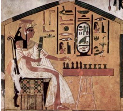
Nefertari playing Senet. Painting in tomb of Egyptian Queen Nefertari (1295-1255 BC)