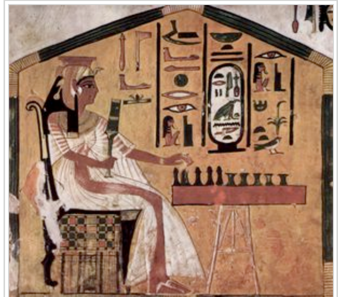
Nefertari playing Senet. Painting in tomb of Egyptian Queen Nefertari (1295–1255 BC)

By the time of the New Kingdom in Egypt (1567–1085 BC), it had become a kind of talisman for the journey of the dead. Because of the element of luck in the game and the Egyptian belief in determinism, it was believed that a successful player was under the protection of the major gods of the national pantheon: Ra, Thoth, and sometimes Osiris. Consequently, Senet boards were often placed in the