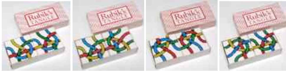
Rubik's Tangle 1, 2, 3, and 4, Matchbox 1990. (Box and twenty seven 2 inch cardboard squares.)

Arrange 25 squares in a 5x5 array so that edges match. Each square has the same pattern of 4 tangled ropes that has two connections on each edge. There is one square for each of the 24 possible combinations of the 4 colors (red, green, blue, and yellow), and one duplicate square. The only difference between Rubik's Tangle 5x5 Versions 1, 2, 3, and 4 is which piece is duplicated. By taking three pieces from a spare set, a single set of 28 squares can be made where three of the duplicates are left out to make one of the 4 puzzles. Below is a set made by starting with a Version 3 and adding three squares taken from a Version 2; the four duplicate squares have been labeled with a number on the back.