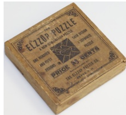
ELZZUP Puzzle Co., Keene, N.H., circa 1900. (3.3" x 3.3" x 3/4" wood box and 10 wood pieces)