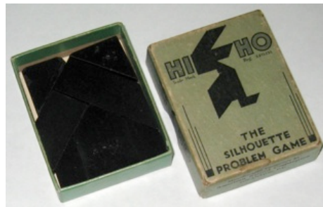
Hi Ho Puzzle, 1932.

(same pieces as the Richter No. 10 Cross Puzzle )