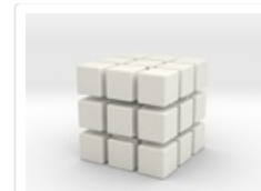
Full Turn Cube $132.42