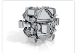
Mixup Octahedron V2 $55.00 by PuzzleMaster...