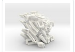
Minimal 7x7x7 - part... $46.87