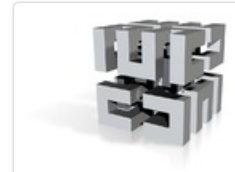
Tiny Baby Hilbert Cube $2.03 by TheMindForest