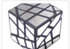
Platinum Cube $99.99 by benpuzzles

Art Puzzles Mathematical Art Games Twisty Puzzle Mechanical Puzzle Rubik's Cube