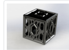
Cube of Visions $81.56 by Intrifix