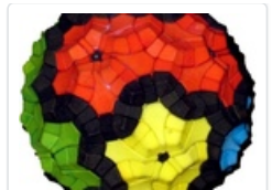
Big Boulder - parts 1... $38.76