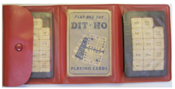
a.k.a. Fourteen Puzzle