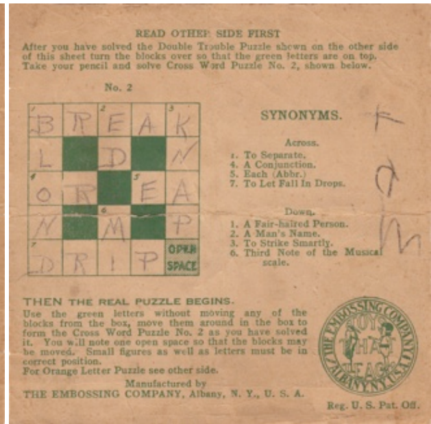
The Embossing Company, Albany, NY, circa 1930's. (cardboard box 4.1" x 4.1" x 1/2" and 24 wood 3/4" x 3/4" x 3/8" wood pieces)

A 5 x 5 version of the Fifteen puzzle. Begin with the orange lettering up, solve the crossword puzzle on the orange side of the directions, and slide the pieces to make that pattern. Then turn over the pieces to have the green lettering up, turn the directions over to green side, solve that crossword puzzle, and slide the pieces to make that pattern. On the right above is each piece of the orange solution turned over.