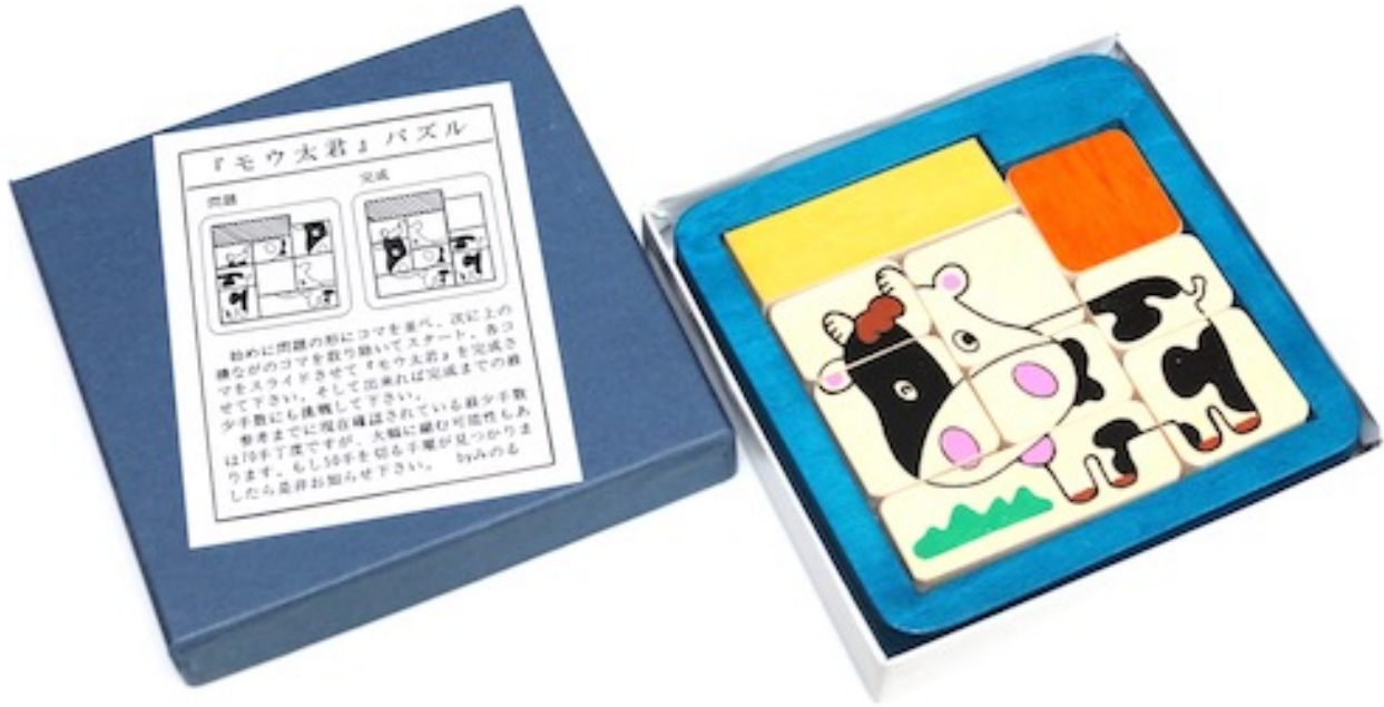
Designed and made by Minour Abe, circa 1985. (cardboard box 4+58" x 4+5/8" x 3/4", wood tray, 8 wood pieces, and yellow keeper)

Starting with the pieces positioned as on the left below, slide them to correctly make the cow: