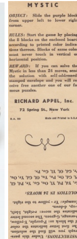
Copyright Richard Appel, Inc., NY, 1943. (2.5"x2.5"x1" cardboard box, 2.4" square board, and eight 13/16" wood cubes; Described on pages 135-136 of the Hordern book, which dates the puzzle)

Start with the cubes placed on the board according to their color, and then move the purple cube in the upper left corner to the lower right corner in such a way that pieces of the same color never touch each other along a side. The two purple blocks may not touch, but are different shades of purple allow one to keep track of which is the one that started in the upper left.