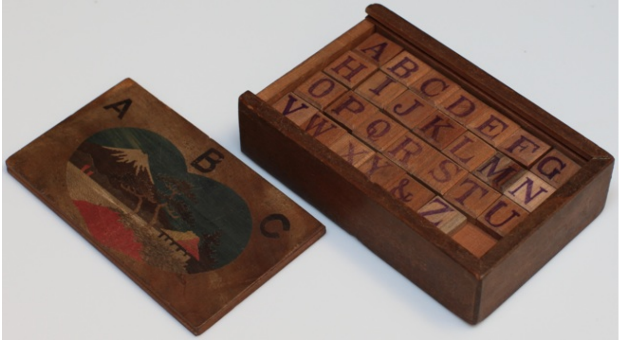
Unknown manufacture. (wood, 3 by 4.75 by 1.25 inches)

A larger version of the Fifteen puzzle that can be solved the same way (see also the 31 and 49 puzzles).