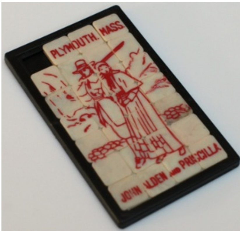
Circa 1960? (plastic, 27 tiles, 4 by 2.4 by 3/16 inches) Copyright J. A. Storer